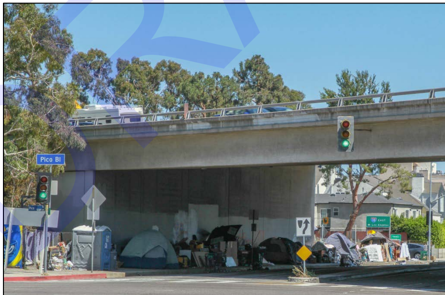
Figure 2. Closer view of homeless encampments on City of Los Angeles side. Underpass of Interstate 10 freeway at Centinela Avenue and Pico Blvd. Date: June 5, 2022.