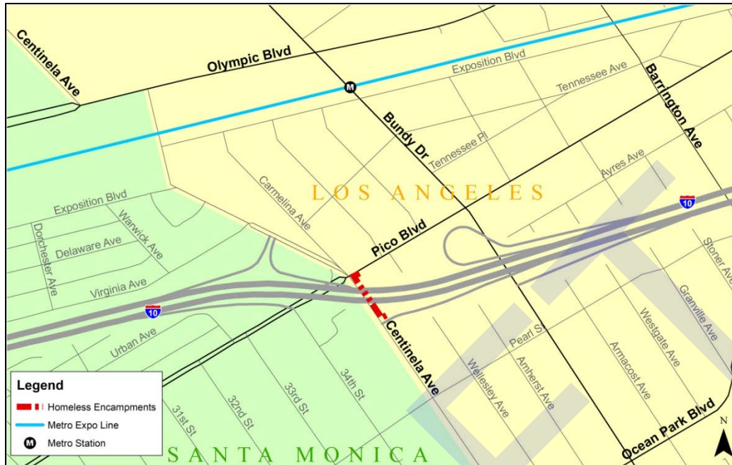
Figure 3. Location of homeless encampments at Interstate 10 freeway underpass at Centinela Avenue and Pico Boulevard in West Los Angeles and Santa Monica city limits. Date: June 5, 2022

Furthermore, nonprofit organizations/homeless advocacy groups, and religious institutions that operate or offer services to the unsheltered do not necessarily have its personnel residing within the City of Los Angeles. It is also unlikely that the elected class will remain living within the City of Los Angeles and raise families adjacent to, across the street from, or anywhere in the vicinity of a homeless shelter/service provider in the foreseeable future; especially when elected officials are more transient than homeowners and other property owners. It also has to be stated that some of the facilities with contracts or funding sources to provide homeless services are also adjacent to R1 or other low density zoning neighborhoods as in the case of Arleta.