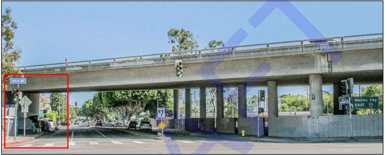
Figure 1. West Los Angeles at underpass of the Interstate 10 freeway at Centinela Avenue and Pico Blvd. Homeless encampments highlighted. Date: June 5, 2022.

Culver City, Santa Monica, Pasadena, Beverly Hills, Alhambra, and South Pasadena—among many others—do not have the degree of homelessness chaos that the City of Los Angeles has. Why is that? Those other cities also have expensive market rate rentals and people becoming homeless but we get to deal with the 41,290 homeless individuals (according to the Los Angeles Homeless Services Authority (LAHSA) 2020 count). 2 In West Los Angeles, the Interstate 10 freeway underpass at Centinela Avenue /Pico Boulevard, Figures 1 and 2 show homeless encampments on the City of Los Angeles side while across Centinela Avenue (right side of the photograph in Figure 1) the City of Santa Monica has no encampments whatsoever.