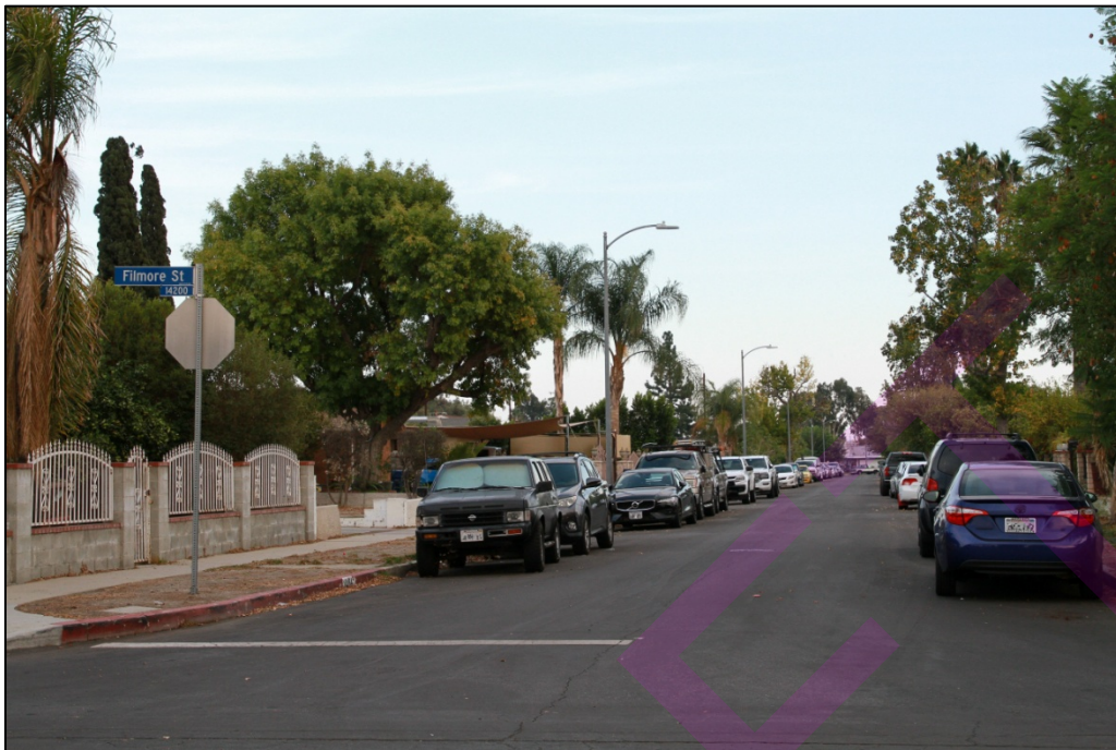
Figure 4. 14200 block of Filmore Street in Arleta. No street parking spaces available. Looking south on Woodale Avenue. Date: October 24, 2021.

Metro's East San Fernando Valley Light-Rail (ESFV LRT) is projected to be ready in 2028. 4 One only needs to look at North Hollywood's NoHo 14 complex (Figure 5) and West Adams' Cumulus Project 5 (Figure 6) for proof that dense housing developments have been situated adjacent or in proximity to major transit—and more developments are underway as Metro is also considering new housing on its own property at the North Hollywood Metro Rail Station. 6 Can you imagine the surrounding neighborhoods if the new developments do not have parking with AB 1401 as law?