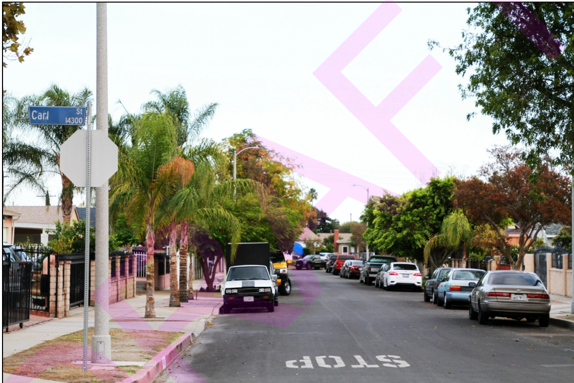
Figure 1. 14300 block of Carl Street at Gullo Avenue in Arleta. No street parking spaces available. Date: October 24, 2021.

Arleta already has many of its single-family zoned neighborhoods without street parking space and that is due to a number of factors such as the unaffordability of housing, more family members remaining in the same household while acquiring private automobiles, the pandemic, working from home, loss of income, and other. See Figures 1, 2, 3 and 4.