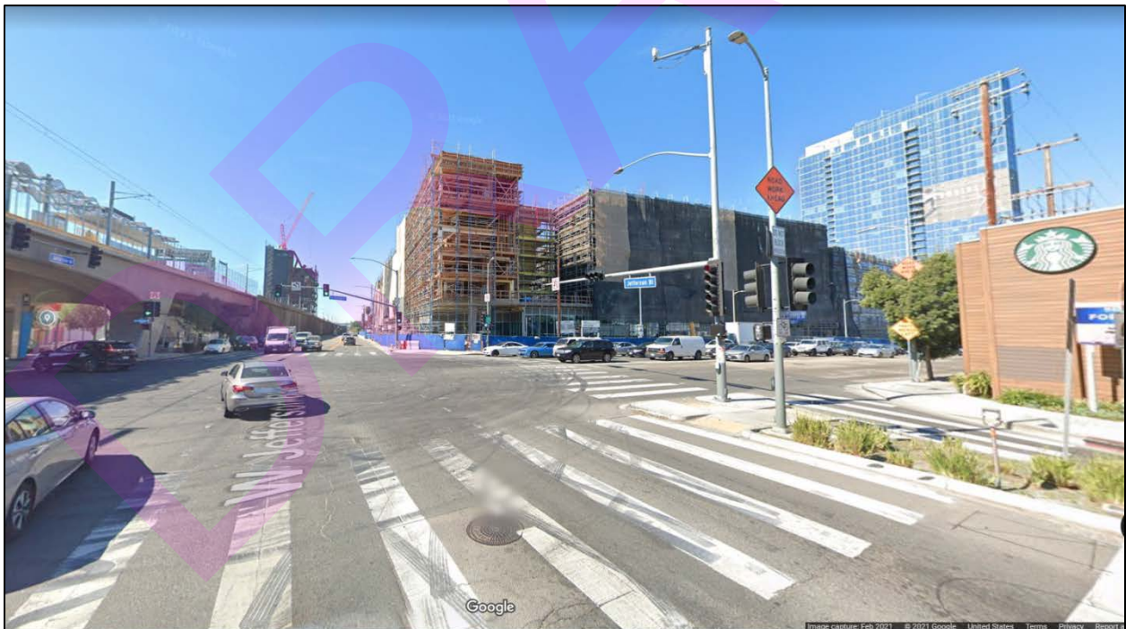
Figure 6. Major housing complexes at La Cienega Blvd and Jefferson Blvd adjacent to Metro E Line (Expo). Copyright 2021 Google.