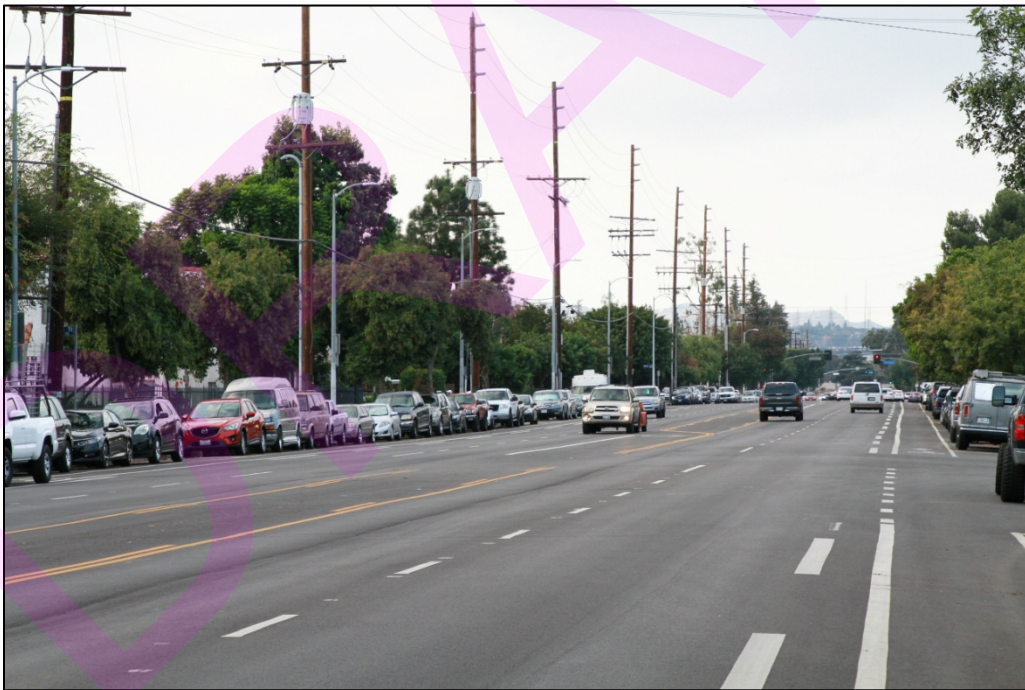
Figure 3. 9500 block of Woodman Avenue in Arleta. No street parking spaces available. Looking northwest towards Van Nuys Blvd. Date: October 24, 2021.