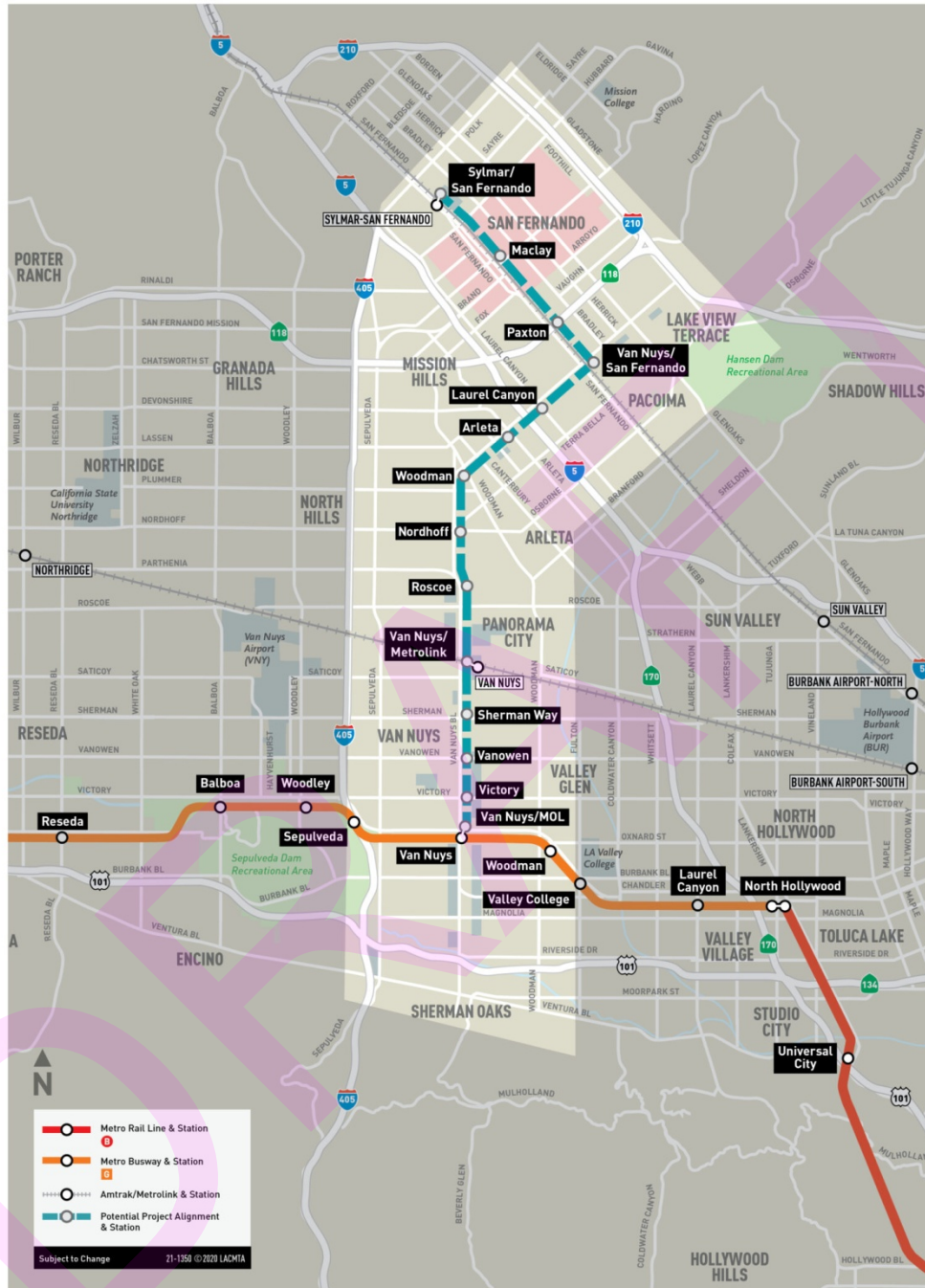
Figure 7. Metro's East San Fernando Valley Light Rail Transit project study area. Metro 2021.