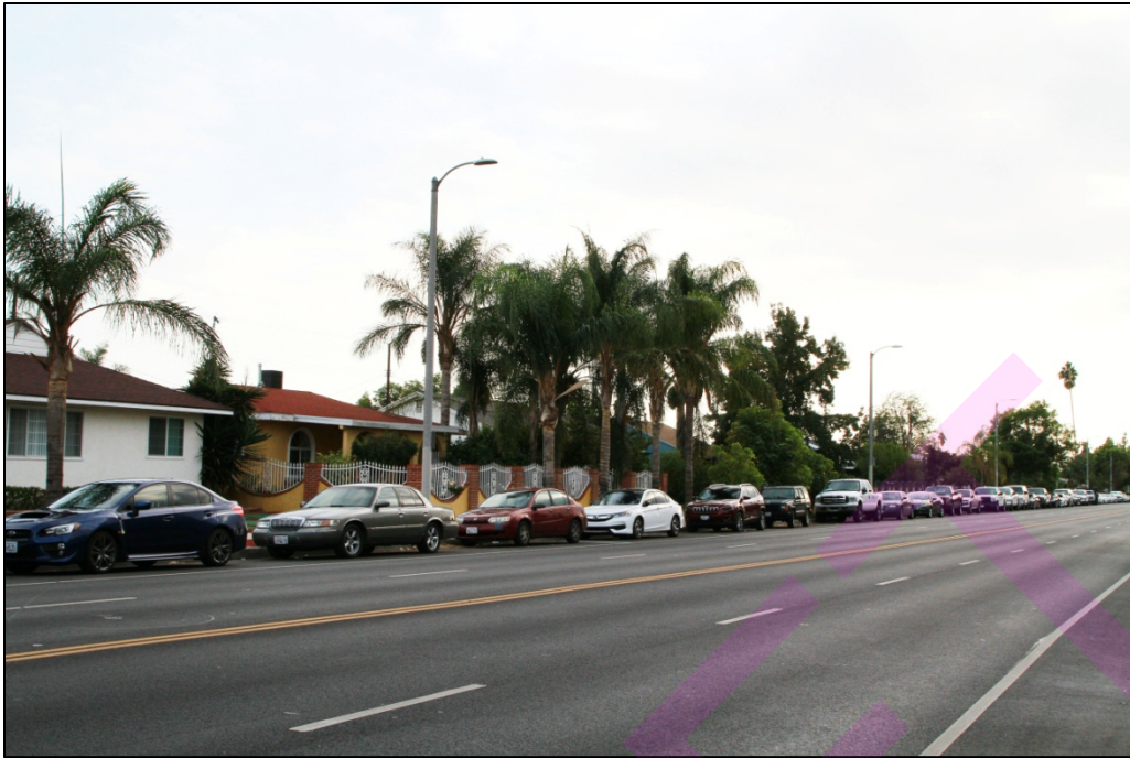
Figure 2. 14000 block of Terra Bella Street in Arleta. No street parking spaces available. Date: October 24, 2021.