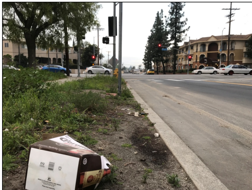
Figure 7. Litter: Corona beer 12-pack box at southeast corner of Woodman Av and Filmore Street; in front of single-family home. February 27, 2019.