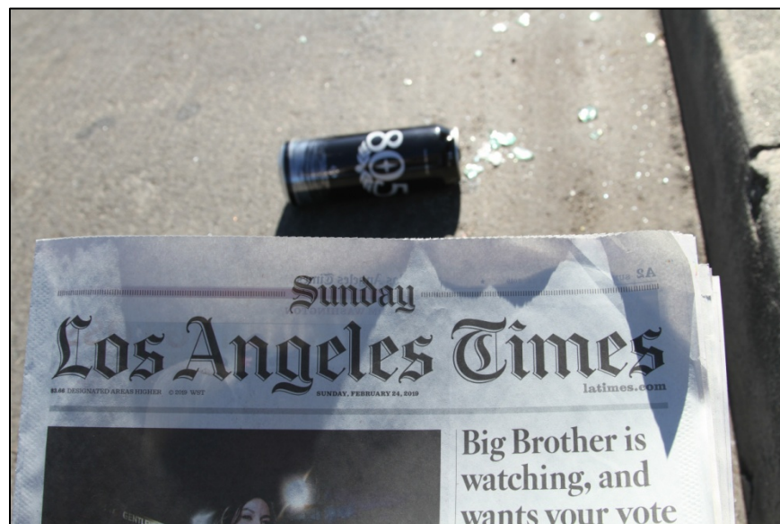
Figure 1. A can of 805 beer is in front of a single-family home in Arleta. February 24, 2019.

The Mayor's Office, City Council, and its Committees must maintain the current CUB entitlement process, implement an expedited revocation process for nuisance ABC establishments, hire more code enforcement officers, and have an opt-out program for communities that do not wish to participate in RBP should the standards get adopted despite the opposition to them here, and require a public hearing requisite for all CUB applicants.