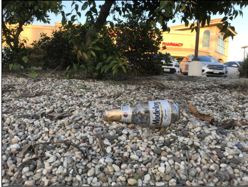
Figure 6. Modelo beer bottle at Walgreens, 9750 Woodman Ave on February 25, 2019.