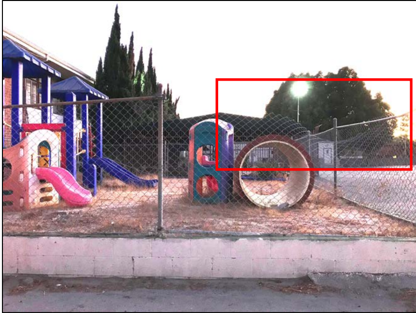
Figure 16. Fence has been broken-in at children's playground adjacent to alley of child day care center in Arleta. September 29, 2019.