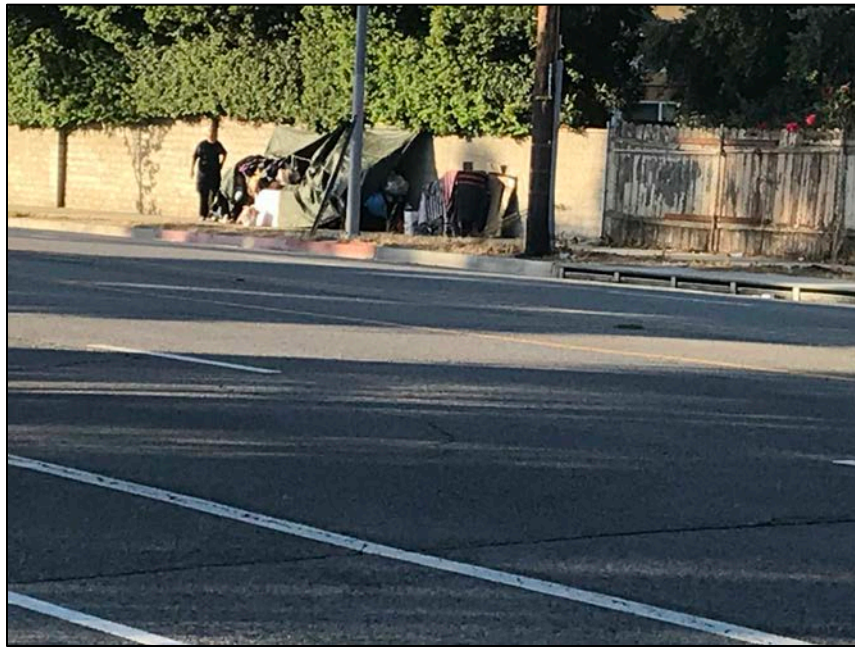
Figure 6. Homeless encampment (adjacent to single-family residences) along Woodman Avenue, north of Mission Hills Estates Ct, Mission Hills. September 7, 2019.