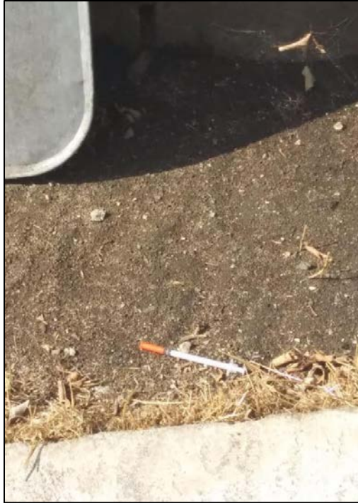
Figure 4. Hypodermic needle found in the vicinity of Canterbury Avenue and Pierce St in Arleta.