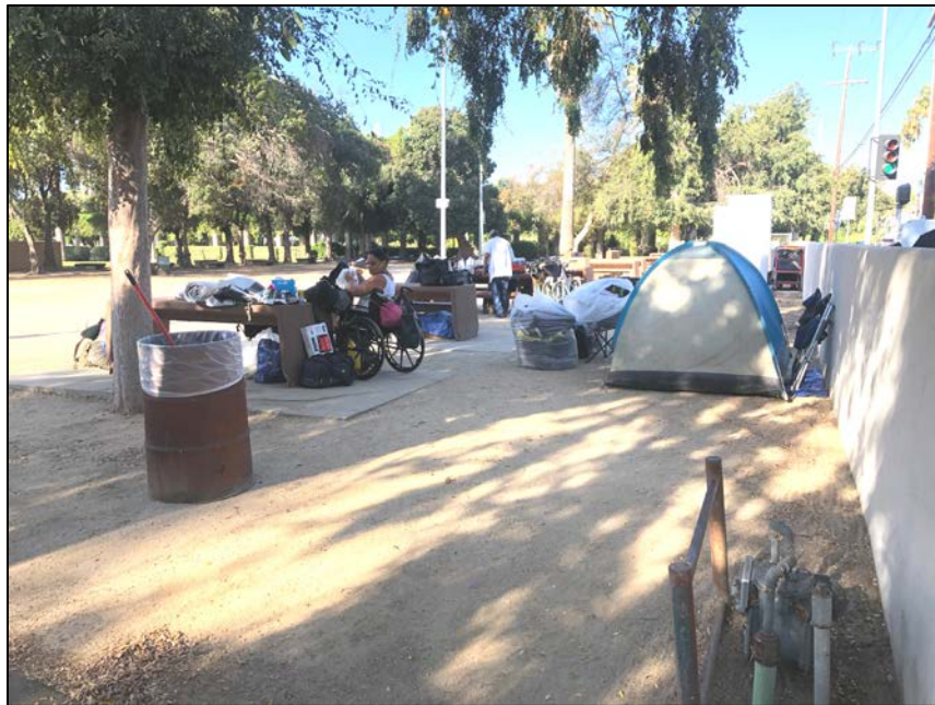
Figure 13. Homeless encampment at Brand Park, 15121 S Brand Blvd, Mission Hills.