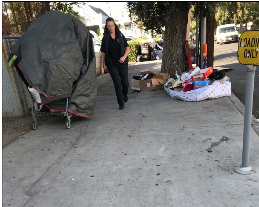
Figure 11. Homeless encampment belongings on same sidewalk shown in Figure 10 in the vicinity of Van Nuys Elementary. Location at 14401 Victory Blvd, Van Nuys. October 10, 2019