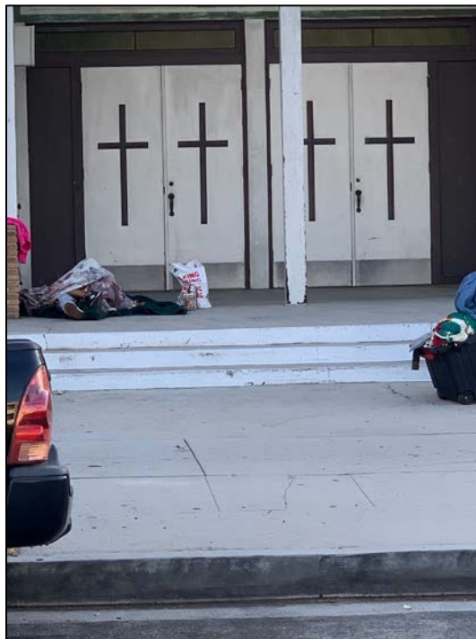
Figure 7. Homeless individual sleeping at Calvary Lutheran Church, 8800 Woodman Avenue, Arleta. While not shown in this picture a child day care center is on site.