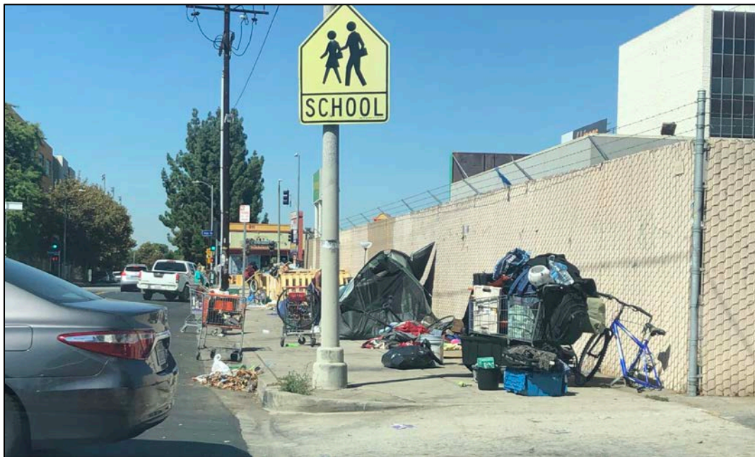
Figure 9. Homeless encampments along route to Panorama City High School. Location at Lanark Street side of 8100 Van Nuys Blvd, Panorama City. Sidewalk access is blocked by homeless belongings and encampments. September 12, 2019.