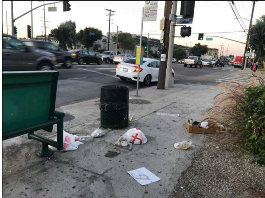
Figure 2. Trash removed from trash receptacle. 9700 block of Woodman Ave, Arleta; Southbound Van Nuys Blvd side, bus stop. September 25, 2019.