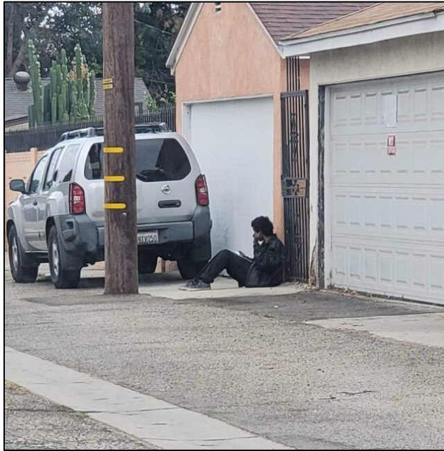
Figure 14. Homeless drug addict behind single-family residences in alley in the 9400 block of Dorrington Avenue in Arleta.