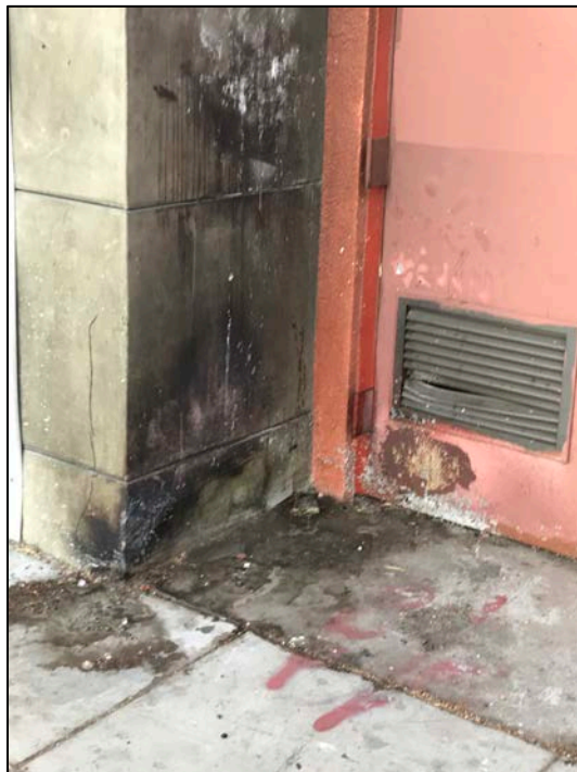
Figure 5. Human defecation residuals and possible extinguished fire site. 6643 Van Nuys Blvd, Van Nuys. September 25, 2019.