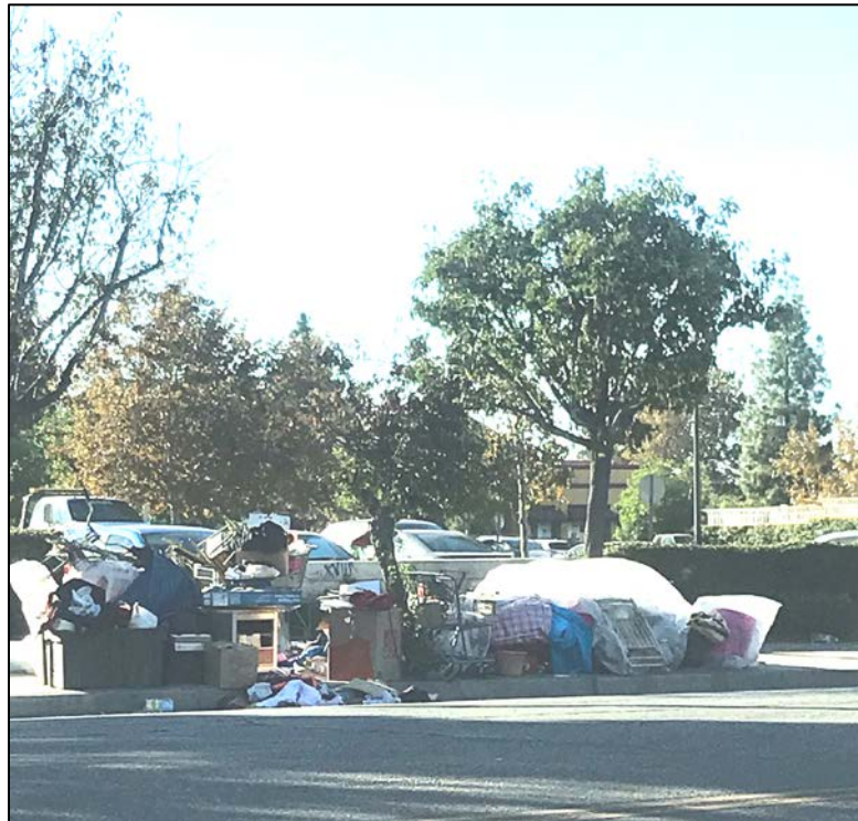
Figure 17. Homeless encampment at El Super supermarket, route to Liggett Street Elementary and Arleta High School. Location at 9710 Woodman Avenue, on Van Nuys Blvd side. October 31, 2019.