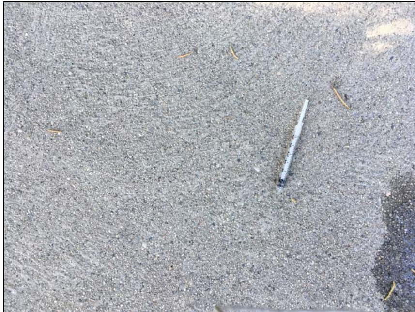
Figure 3. Hypodermic needle found in vicinity of Canterbury Avenue and Remington St in Arleta.