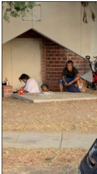
Figure 15. Homeless encampment at church side entrance/exit at Calvary Lutheran Church, 8800 Woodman Avenue, Arleta: Montague Street side. Child day care center on site.