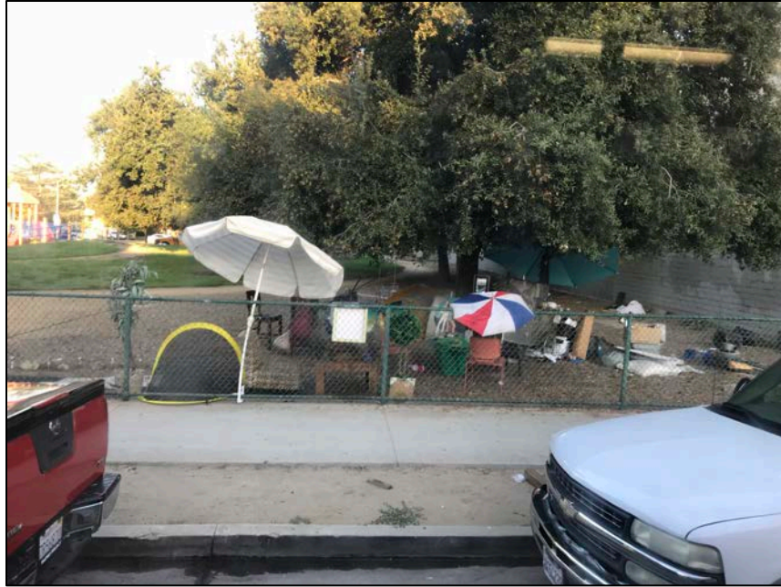
Figure 8. Homeless encampment at Tobias Avenue Park, 9122 Tobias Avenue, Panorama City. August 27, 2019. View from Van Nuys Blvd side.