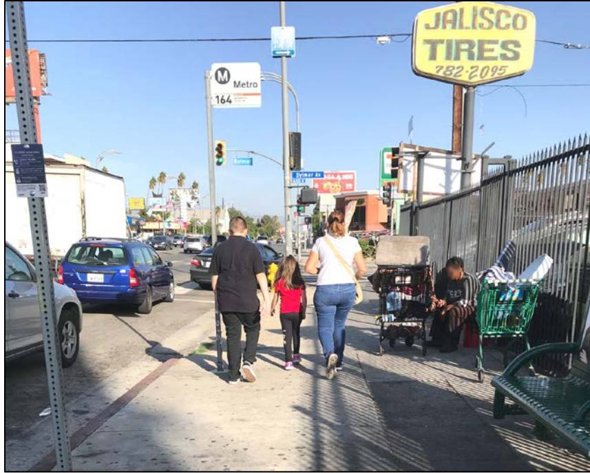
Figure 12. Parent and children walk by homeless individual along Victory Blvd at Sylmar Av. Location at 14412 Victory Blvd, Van Nuys. October 10, 2019