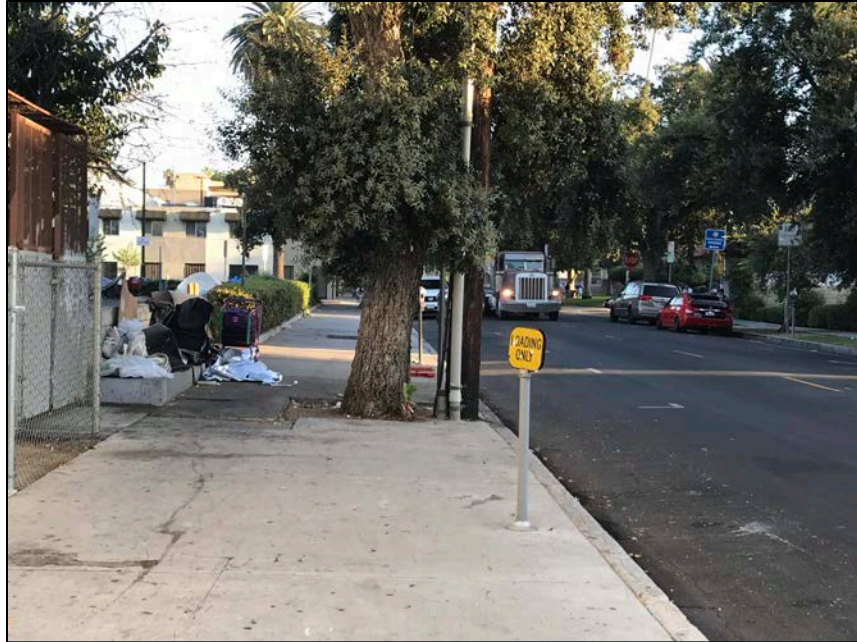
Figure 10. Homeless encampment on left side of the picture by shopping cart and Van Nuys Elementary in the background beyond the stop sign shown on the right side of the photo. Location at 14401 Victory Blvd, Van Nuys. September 25, 2019.